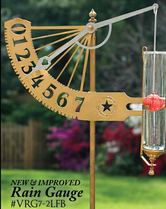
NEW & IMPROVED Rain Gauge #VRG7-2LFB