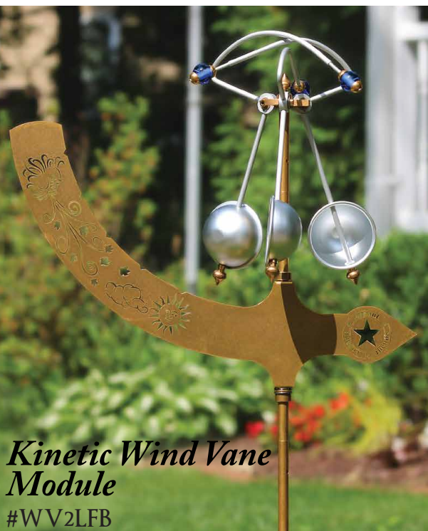
Kinetic Wind Vane Module #WV2LFB