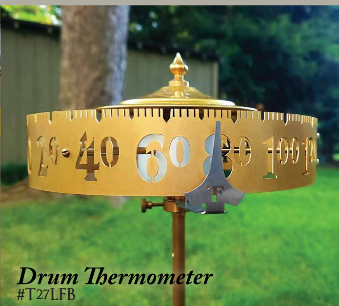
Drum Thermometer #T27LFB