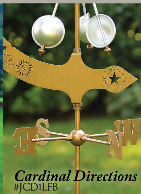
Cardinal Directions #JCD1LFB