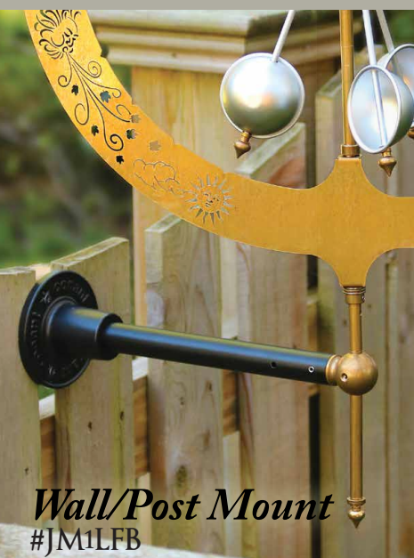
Wall/Post Mount #JM1LFB