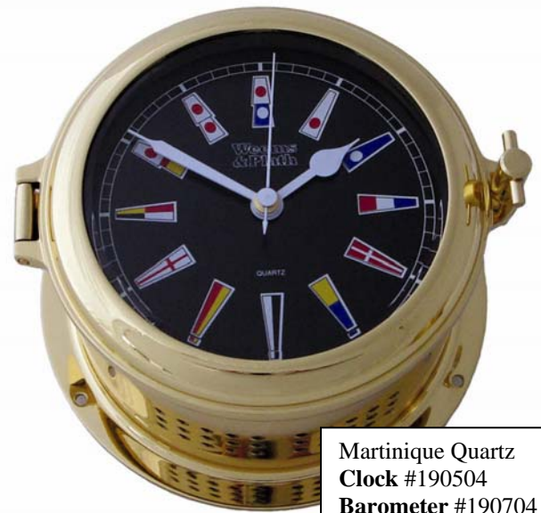
Martinique Quartz Clock #190504 Barometer #190704