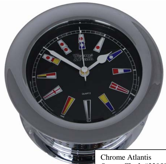
Chrome Atlantis Quartz Clock #220504 Barometer #220704