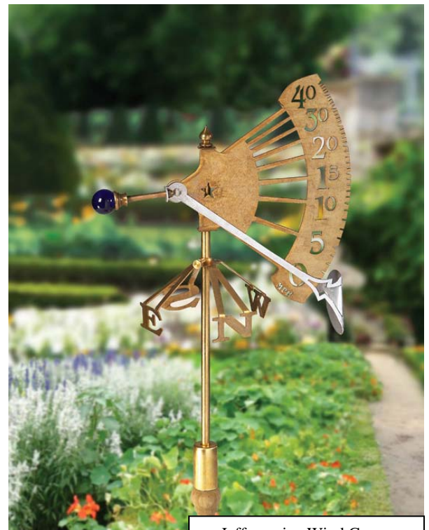
Jeffersonian Wind Gauge (item # WG-1)